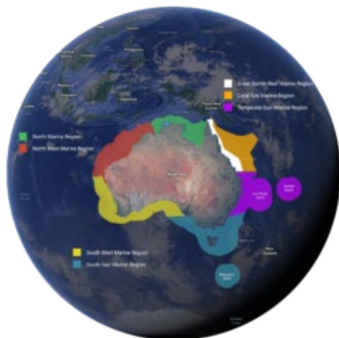
Fig: Australian Marine bioregional plans